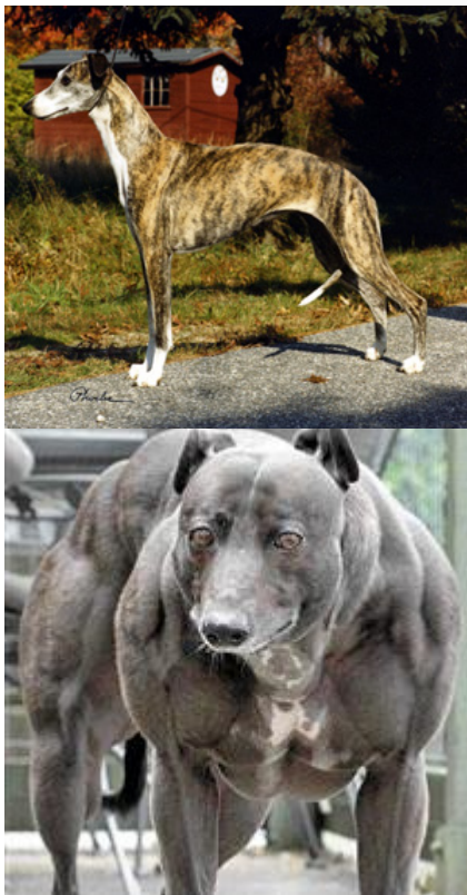
Top: Normal Whippet

www.westminsterkennelclub.org/breedinformation/hound/images/whippet.jpg