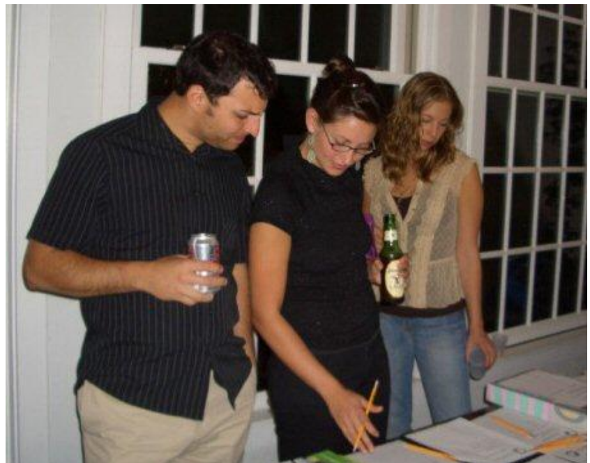
SPDOA Members hard at work at the silent auction

BE PART OF THE SOLUTION NOT JUST A COMPLAINER